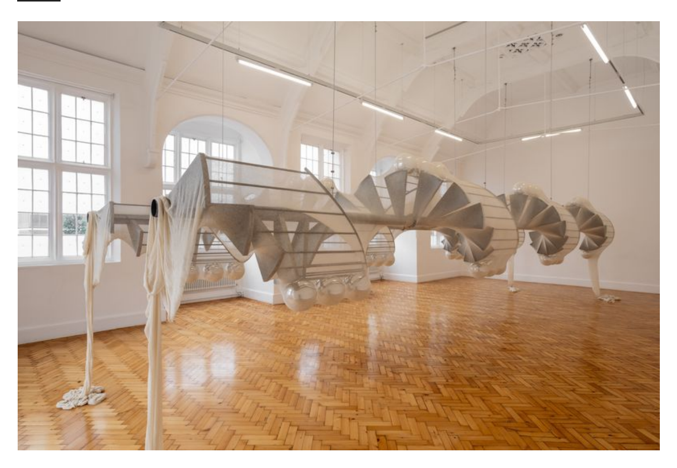
<u>Installation view of Jack O'Brien, The Reward at Camden Art Centre, 2024.</u>