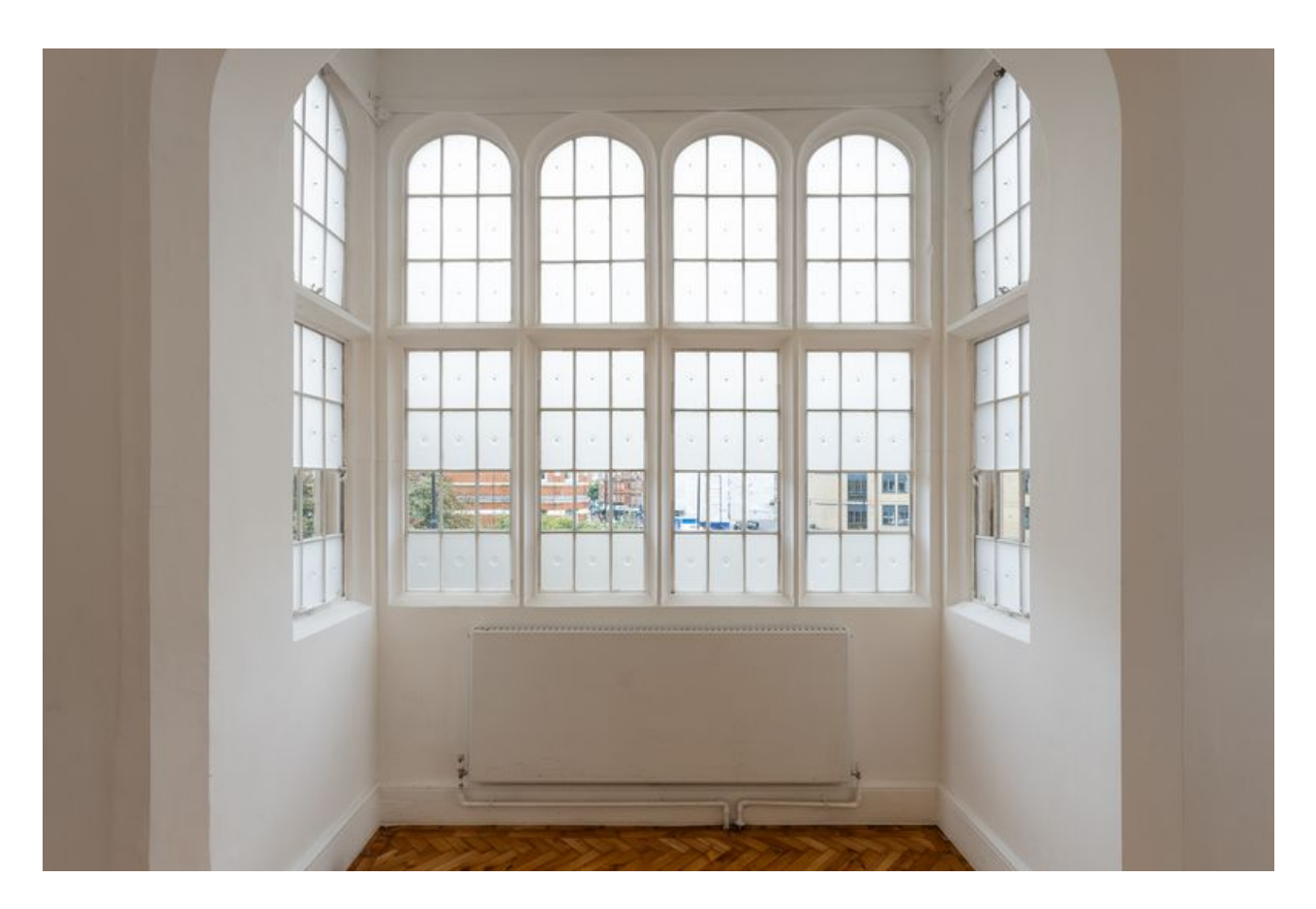
<u>Installation view of Jack O'Brien, The Reward at Camden Art Centre, 2024.</u>