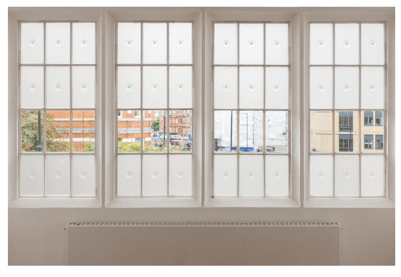
<u>Installation view of Jack O'Brien, The Reward at Camden Art Centre, 2024.</u>