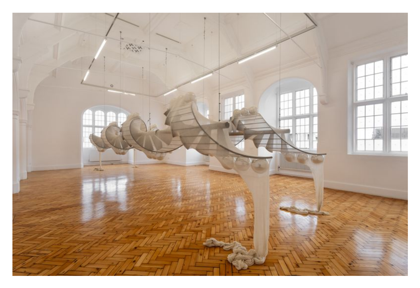
<u>Installation view of Jack O'Brien, The Reward at Camden Art Centre, 2024.</u>