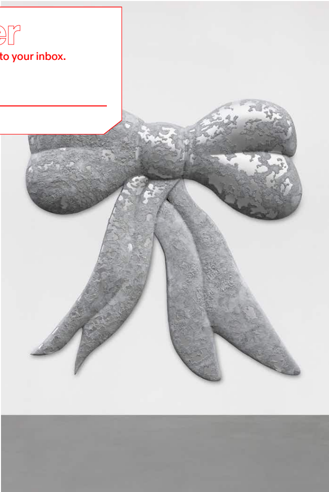
Shuang Li, The Guillotine (Future) , (2024)

Remember the SS23 Miu Miu collection? Good start. As well as the FKA twigs cameo and belted micro-skirts galore, it was also notable for the hulking great white flashing behind the dress room doorway. Well, that dystopian film installation – Miuccia Prada is an arthouse cinephile and art film diehard – was by Shuang Li, the Chinese contemporary artist whose practice spans hyper-real film, sculpture and mixed-media assemblage. “It was such a special experience! It was my first time working in fashion but also attending a fashion show,” remembers Shuang Li. “I had totally no idea what I was in for. We had a lot of brainstorming sessions with Mrs Prada and OMA, which was very inspiring.”