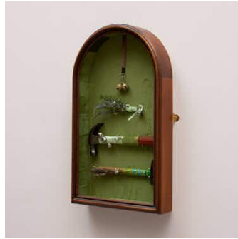
Jesse Darling, Deeds III (2023)

As an artist, Jesse Darling is rigorous, both in theory and practice. Working largely within sculpture, he graduated Central Saint Martins in 2010, going on to do an MA at Slade. Since then, he's been using his work as an inherently political tool, unpicking problems – like class struggle, for example – in a way that's both acerbic and accessible, though never populist. In 2023, he was announced as the Turner Prize winner, which in art world terms puts him up with the likes of Mark Leckey , Wolfgang Tillmans , Tai Shani and Gillian Wearing. In other words, he's kind of a big deal. As the Daily Mail took great delight in announcing, he was also the first trans artist to win the Turner Prize, but therein lies so much of the initial confusion surrounding his work.