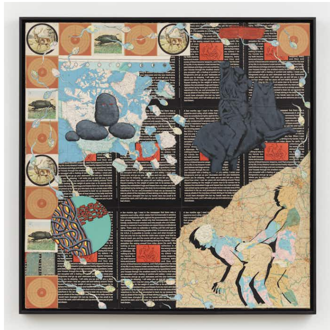
David Wojnarowicz, Untitled (1985-87)

No doubt you'll have seen the late David Wojnarowicz's work at some point in fashion lore. As early as 2018, Loewe worked with the artist's