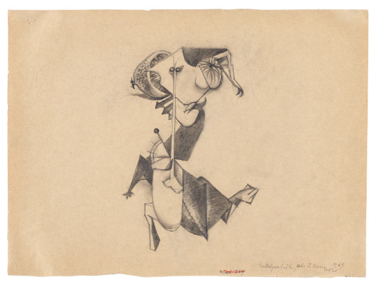
Self-portrait as a Lemon (1949), Maria Lassnig.

There were some false starts along the way. The earliest works on display were produced in the immediate aftermath of the Second World War, during which Lassnig had been a student at the Academy of Fine Arts in Nazi-controlled Vienna, where 'everything modern was kept away from us'. Now a 'magic realm of artistic -isms' opened up to the young painter, which she set about emulating: Surrealist-inspired drawings with titles like Self-Portrait as a Lemon (1949); neat geometric and more gestural abstractions dancing between cubism and tachism. Increasingly she leaned towards the latter, stripping away any obvious figuration in a series of white-painted canvases, carved up with sinuous lines in rainbow colours: 'a red of pain', 'juicy flesh tones', green, blue. The brushstrokes are wide and loose; the layers of paint, liberally mixed with turpentine, are translucent like skin. But looking at these works, it's hard to relate them to any physical experience beyond the act of painting itself. 'I became a general laughingstock for calling my dumplings and masses of colors "self-portraits",' Lassnig recalled.